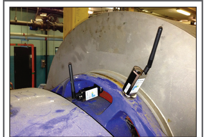
Top: The location of two SmartDiagnostics® vibration sensors on a dewatering centrifuge at a wastewater treatment plant. Bottom: A screen capture of the data coming from a dewatering centrifuge showing increasing vibration levels and potential failure.

Leveraging the low-cost and simple solution, SmartDiagnostics® sensors were installed on the axial and radial bearing points of both centrifuges. The system was installed rapidly and was set up for monitoring by the facility operator. After three months of operation, an axial sensor point identified a developing machine behavior that could have otherwise gone unnoticed.